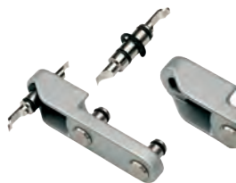
#EAK0268J62A 4" Extension kit