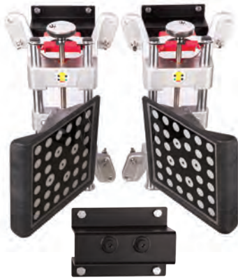
#EAK0335V22A Wall mount kit for clamps and targets (set of 4pcs)