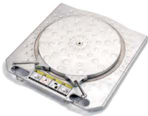
#EAK0277J55A Turntable 45mm #EAK0289J07C Turntable 50mm