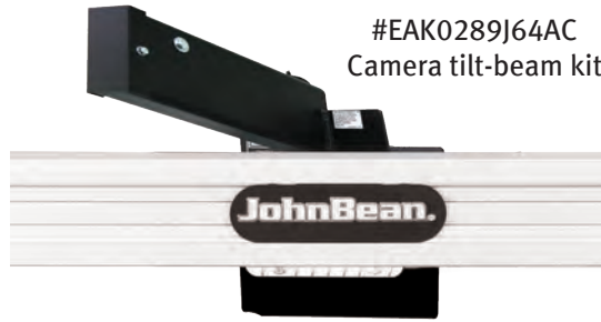
#EAK0289J64AC Camera tilt-beam kit