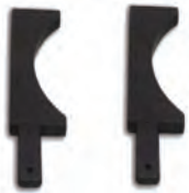
#EAK0277J28A Paddle roll-back kit